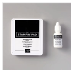
Uninked Stampin' Pad & Whisper White Refill - 147277