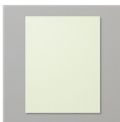
Soft Sea Foam 8- 1/2" X 11" Cardstock - 146988