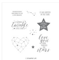
Little Twinkle Clear-Mount Stamp Set - 146452