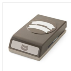
Duet Banner Punch - 141483