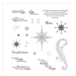
Star Of Light Photopolymer Stamp Set - 142110

angelstamps@hotmail.com angelstamps1.blogspot.com