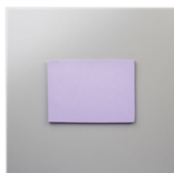
Simply Shammy - 147042