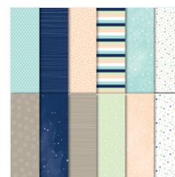
Twinkle Twinkle Designer Series Paper - 146284