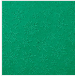
Winter Snow Embossing Folder - 153577