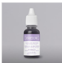
Highland Heather Classic Stampin' Ink Refill - 147167