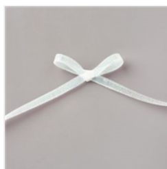
Snowflake Splendor 1/4" (6.4 Mm) Ribbon - 153548