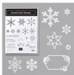
Snowflake Wishes Bundle (English) - 155172