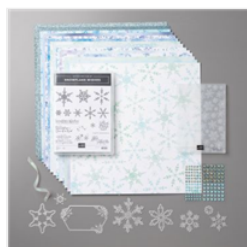
Snowflake Splendor Suite Collection (English) - 155115