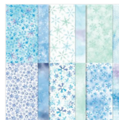
Snowflake Splendor Designer Series Paper - 153512