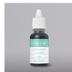
Coastal Cabana Classic Stampin' Ink Refill - 131164