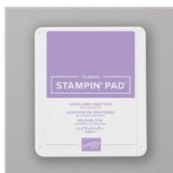
Highland Heather Classic Stampin' Pad - 147103