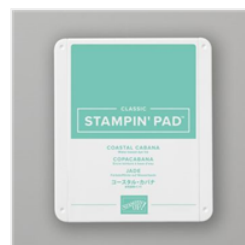
Coastal Cabana Classic Stampin' Pad - 147097