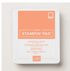
Grapefruit Grove Classic Stampin' Pad - 147142