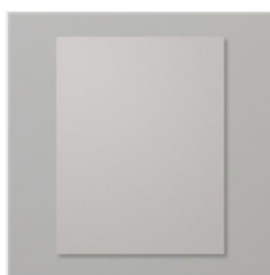
Gray Granite 8- 1/2" X 11" Cardstock - 146983