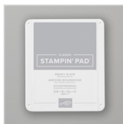
Smoky Slate Classic Stampin' Pad - 147113