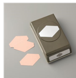
Tailored Tag Punch - 145667