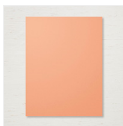
Grapefruit Grove 8-1/2" X 11" Cardstock - 146972