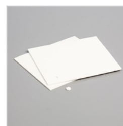
Mini Stampin' Dimensionals - 144108