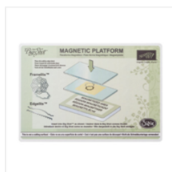
Magnetic Platform - 130658