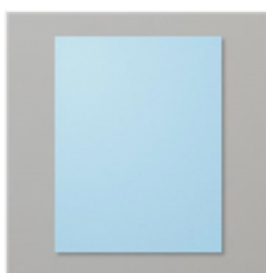
Balmy Blue 8-1/2" X 11" Cardstock - 146982