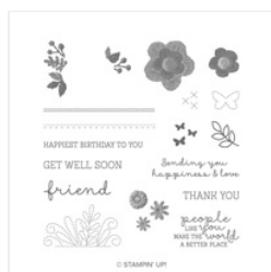
Needle & Thread Photopolymer Stamp Set - 148724

angelstamps@hotmail.com angelstamps1.blogspot.com