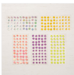
Gingham Gala Adhesive-Backed Sequins - 148561