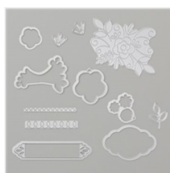
Needlepoint Elements Framelits Dies - 148541