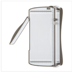
Stampin' Trimmer - 126889

angelstamps@hotmail.com angelstamps1.blogspot.com