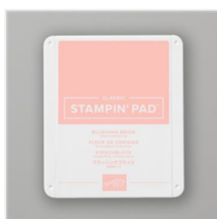
Blushing Bride Classic Stampin' Pad - 147100