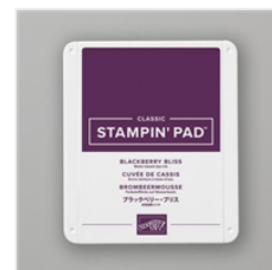
Blackberry Bliss Classic Stampin' Pad - 147092