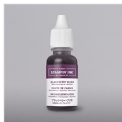
Blackberry Bliss Classic Stampin' Ink Refill - 133648