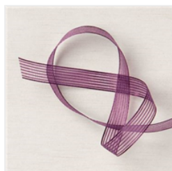
Blackberry Bliss 3/8" (1 Cm) Striped Ribbon - 154569