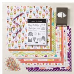
Ice Cream Corner Suite Collection (English) - 155984