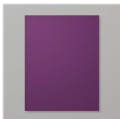
Blackberry Bliss 1/2" X 11" Cardstock - 133675