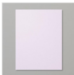
Purple Posy 8-1/2" X 11" Cardstock - 150881