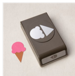
Ice Cream Cone Builder Punch - 154241