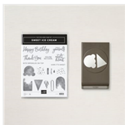
Sweet Ice Cream Bundle (English) - 156244