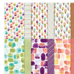
Ice Cream Corner 12" X 12" (30.5 X 30.5 Cm) Designer Series Paper - 154567