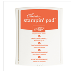
Tangerine Tango Classic Stampin' Pad - 126946