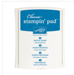
Pacific Point Classic Stampin' Pad - 126951