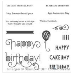
Age Awareness Photopolymer Stamp Set - 135381