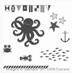
Sea Street Wood-Mount Stamp Set - 133985

stampswellwithothers@gmail.com http://donnas-stampswellwithothers.blogspot.com/