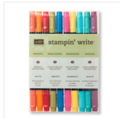
Brights Stampin' Write Markers - 131259