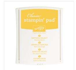
Daffodil Delight Classic Stampin' Pad - 126944