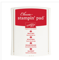
Real Red Classic Stampin' Pad - 126949