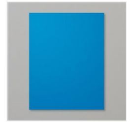
Pacific Point 8-1/2" X 11" Cardstock - 111350