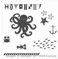
Sea Street Clear-Mount Stamp Set - 133988