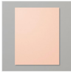
Petal Pink 8-1/2" X 11" Cardstock - 146985