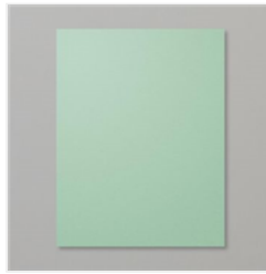
Mint Macaron 8- 1/2" X 11" Cardstock - 138337