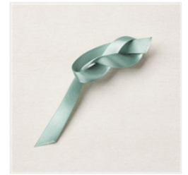
Soft Succulent 1/2" (1.3 Cm) Satin Shimmer Ribbon - 158133