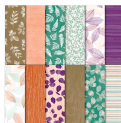
Nature's Poem Designer Series Paper - 146338 Price: $11.00