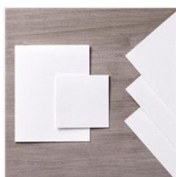
Whisper White 8- 1/2" X 11" Thick Cardstock - 140272 Price: $8.25