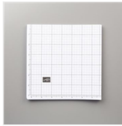
Small Grid Paper - 149621