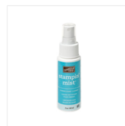
Stampin' Mist - 102394 Price: $5.00