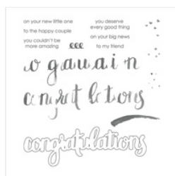
Amazing Congratulations Photopolymer Stamp Set - 145938 Price: $21.00