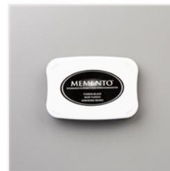
Tuxedo Black Memento Ink Pad - 132708 Price: $8.00