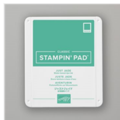
Just Jade Classic Stampin' Pad - 153115 Price: $7.50