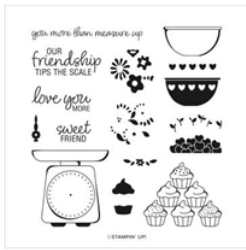
Measure Of Love Photopolymer Stamp Set (English) - 154997 Price: $17.00

Marisa Alvarez 847 922-6795 call/text marisa@kitchentablestamper.com marisaalvarez.stampinup.net