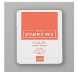
Calypso Coral Classic Stampin' Pad - 147101 Price: $11.00