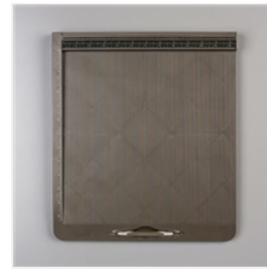
Simply Scored Scoring Tool - 122334 Price: $37.00