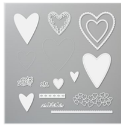
Be Mine Stitched Dies - 151814 Price: $35.00