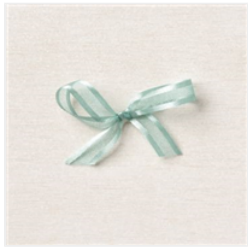
Soft Succulent 3/8\" (1 Cm) Open Weave Ribbon - 155780 Price: $7.00

Marisa Alvarez 847 922-6795 call/text marisa@kitchentablestamper.com marisaalvarez.stampinup.net