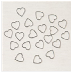
Heart Charms - 154282 Price: $7.50