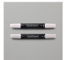
Gray Granite Stampin' Blends Combo Pack - 154886 Price: $12.00