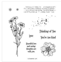
Quiet Meadow Cling Stamp Set - 155082 Price: $21.00