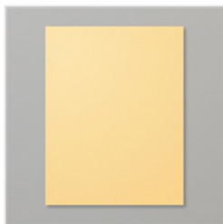
So Saffron 8-1/2" X 11" Cardstock - 105118 Price: $9.25