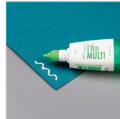
Multipurpose Liquid Glue - 110755 Price: $6.50