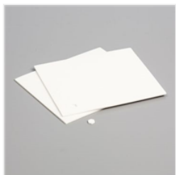
Mini Stampin' Dimensionals - 144108 Price: $5.00