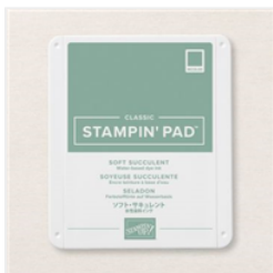
Soft Succulent Classic Stampin' Pad - 155778 Price: $8.00