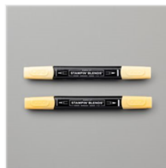
So Saffron Stampin' Blends Combo Pack - 154905 Price: $9.00