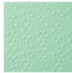
Ornate Floral 3D Embossing Folder - 152725 Price: $9.00