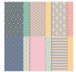
Sweet Symmetry 12" X 12" (30.5 X 30.5 Cm) Designer Series Paper - 155605 Price: $11.50