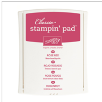
Rose Red Classic Stampin' Pad