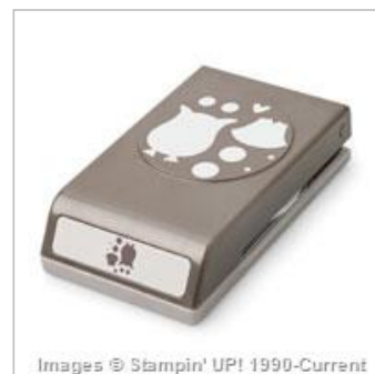
Owl Builder Punch