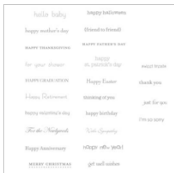
Teeny Tiny Wishes Clear-Mount Stamp

Rhonda Price rrpric01@yahoo.com rhondaprice.stampinup.net