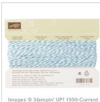
Island Indigo Baker's