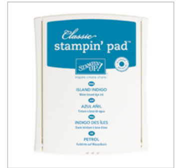
Island Indigo Classic Stampin' Pad