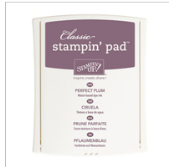
Perfect Plum Classic Stampin' Pad