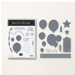
Beautiful Balloons Bundle (English) - 161457