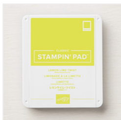
Lemon Lime Twist Classic Stampin' Pad - 147145