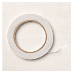
Tear & Tape Adhesive - 154031