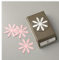
Daisy Punch - 143713