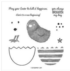
Full Of Happiness Photopolymer Stamp Set - 151539