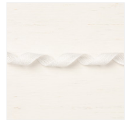
Whisper White 5/8" (1.6 Cm) Flax Ribbon - 148764