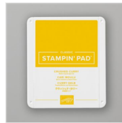
Crushed Curry Classic Stampin' Pad - 147087