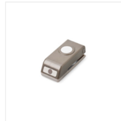
1/2" (1.3 Cm) Circle Punch - 119869