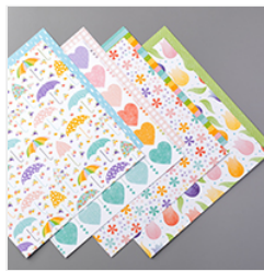
Pleased As Punch Designer Series Paper - 153558