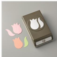
Tulip Builder Punch - 151295