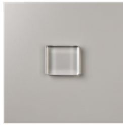
Clear Block C - 118486