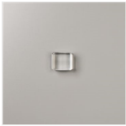
Clear Block A - 118487