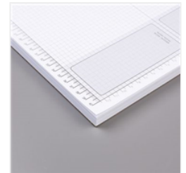
Grid Paper - 130148