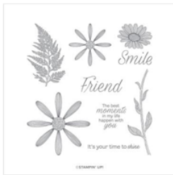
Daisy Lane Cling Stamp Set (En) - 149325