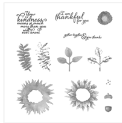
Painted Harvest Photopolymer Stamp Set - 144783