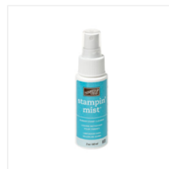
Stampin' Mist - 102394