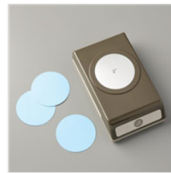
2" (5.1 Cm) Circle Punch - 133782