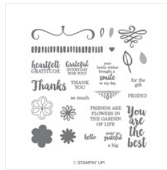
A Big Thank You Photopolymer Stamp Set - 147377