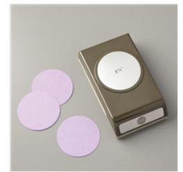
2-1/4" (5.7 Cm) Circle Punch - 143720