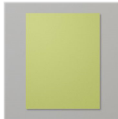
Pear Pizzazz 8-1/2" X 11" Cardstock - 131201