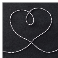
Basic Black Baker's Twine - 134576