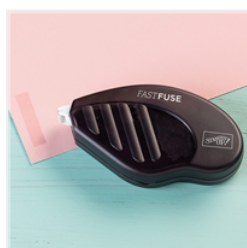
Fast Fuse Adhesive - 129026