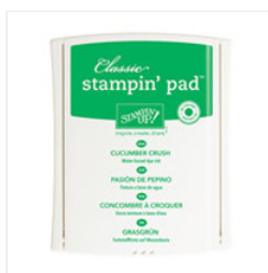
Cucumber Crush Classic Stampin' Pad - 138324