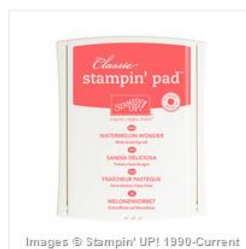
Watermelon Wonder Classic Stampin' Pad - 138323