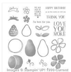
Fresh Fruit Photopolymer Stamp Set - 141770