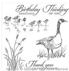
Wetlands Clear-Mount Stamp Set - 126697