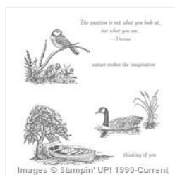
Moon Lake Clear Stamp Set - 138540

http://www.stampinup.net/esuite/home/karenstallman/