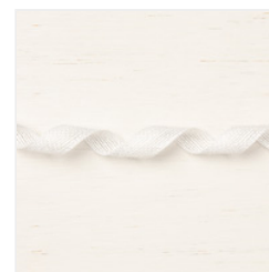
Whisper White 5/8" (1.6 Cm) Flax Ribbon - 148764