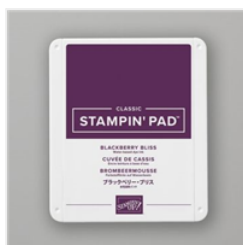
Blackberry Bliss Classic Stampin' Pad - 147092