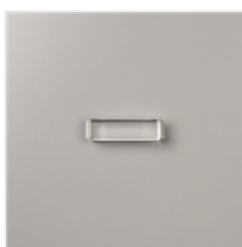
Clear Block G - 118489