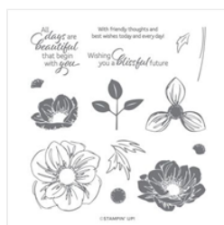
Floral Essence Photopolymer Stamp Set (En) - 149450