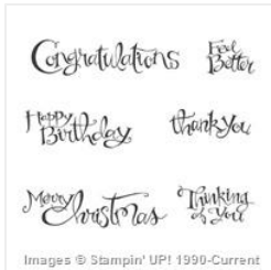
Sassy Salutations Clear-Mount Stamp Set - 126707 Price: $18.00