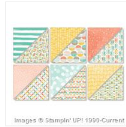
Best Year Ever Designer Series Paper - 138633 Price: $0.00