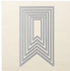
Banners Framelits Dies - 132173 Price: $27.00