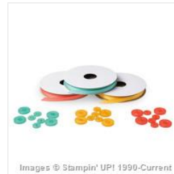
Best Year Ever Accessory Pack - 138634 Price: $0.00