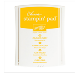
Crushed Curry Classic Stampin' Pad - 131173 Price: $6.50