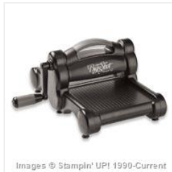
Big Shot - 113439 Price: $110.00