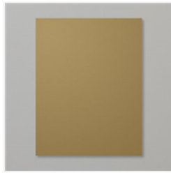
Soft Suede 8-1/2\" data-bbox="250 236 396 311"/>