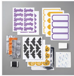
Frights & Delights Kit Refill - 149540 Price: $7.65