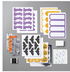
Frights & Delights Kit Refill - 149540 Price: $7.65