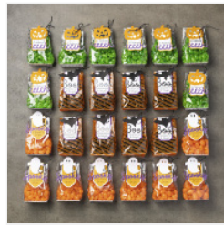
Frights & Delights Kit - 149671 Price: $15.30