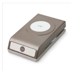
1-3/4" (4.4 Cm) Circle Punch - 119850