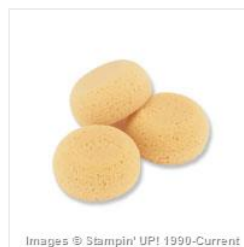
Stamping Sponges - 101610