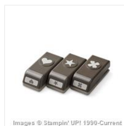
Itty Bitty Accents Punch Pack - 133787