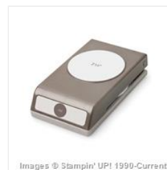
2-1/2" Circle Punch - 120906