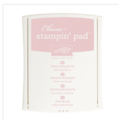
Pink Pirouette Classic Stampin' Pad - 126956