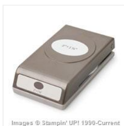
Extra-Large Oval Punch - 119859