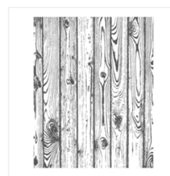
Hardwood Wood-Mount Stamp - 133032