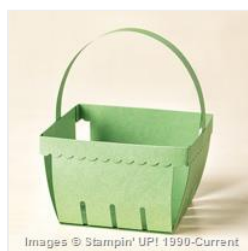
Berry Basket Bigz L Die - 137366

stampswellwithothers@gmail.com http://donnas-stampswellwithothers.blogspot.com/