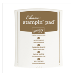
Soft Suede Classic Stampin' Pad - 126978