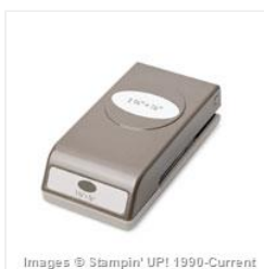
Large Oval Punch - 119855