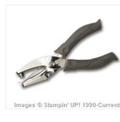
1/4" Circle Punch - 134364