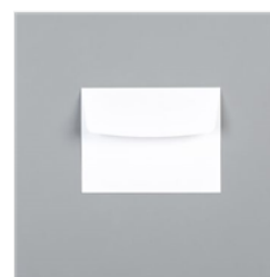
Whisper White Medium Envelopes - 107301