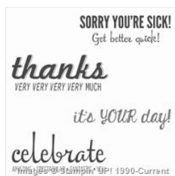
Fabulous Four Clear-Mount Stamp Set - 134174