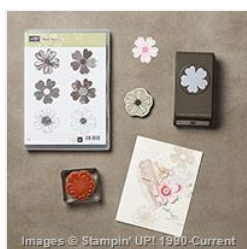
Flower Shop Clear-Mount Bundle - 132726