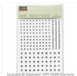
Rhinestone Basic Jewels - 119246