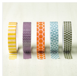
2014-2016 In Color Designer Washi Tape - 138382