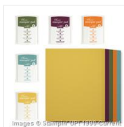
2014-2016 In Color 8-1/2" X 11" Cardstock & Classic Ink Pads Kit - 133673