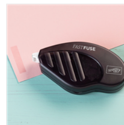
Fast Fuse Adhesive - 129026