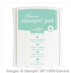
Coastal Cabana Classic Stampin' Pad - 131175