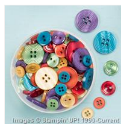
Regals Designer Buttons - 130029