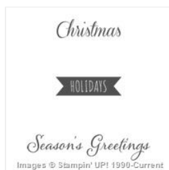
Watercolor Winter Too Photopolymer Stamp Set - 136819