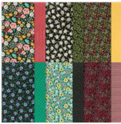
Flower & Field Designer Series Paper - 155223