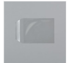
Clear Translucent Medium Envelopes - 102619