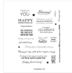
Many Messages Cling Stamp Set - 154510