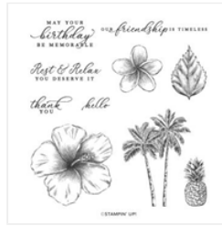
Timeless Tropical Cling Stamp Set (En) - 151497