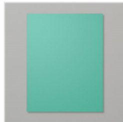
Just Jade 8-1/2" X 11" Cardstock - 153079