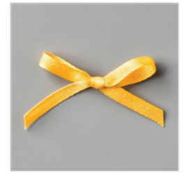
Bumblebee 2020-2022 In Color Ribbon - 153622