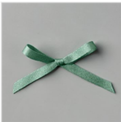
Just Jade 2020-2022 In Color Ribbon - 153621