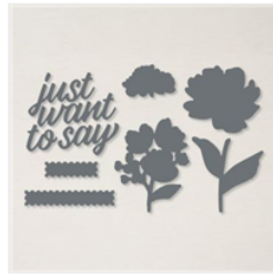
Floral Gallery Dies - 154316