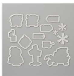
Santa's Signpost Framelits Dies - 147911