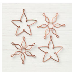
Snowflakes & Stars Wire Elements - 147819