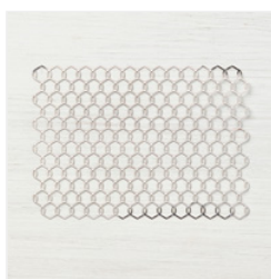
Chicken Wire Elements - 147807