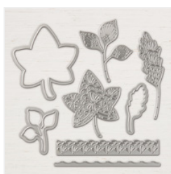
Detailed Leaves Thinlits Dies - 147921