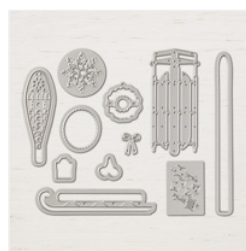
Alpine Sports Thinlits Dies - 147916