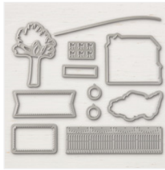
Farmhouse Framelits Dies - 147922