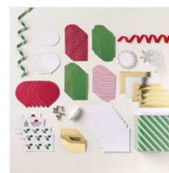
Sincerely Santa Project Kit - 148029