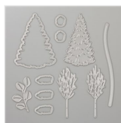
In The Woods Dies - 147919