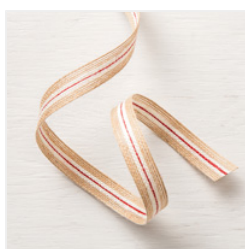
5/8" (1.6 Cm) Striped Burlap Trim - 147889