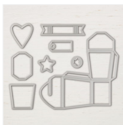
Takeout Thinlits Dies - 147927