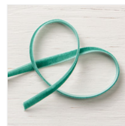
Tranquil Tide 1/4" (6.4 Mm) Velvet Ribbon - 147802