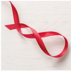
Real Red 3/8" (1 Cm) Mixed Satin Ribbon - 147894