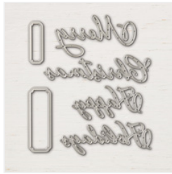
Merry Christmas Dies - 147912