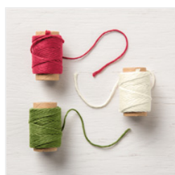
Festive Farmhouse Cotton Twine - 147888