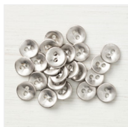
Galvanized Buttons - 147891