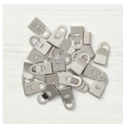
Galvanized Clips - 147806