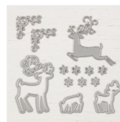
Detailed Deer Dies - 147915