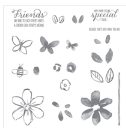
Garden In Bloom Photopolymer Stamp Set - 139433