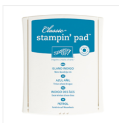
Island Indigo Classic Stampin' Pad - 126986