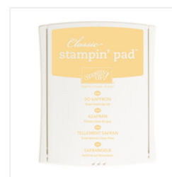
So Saffron Classic Stampin' Pad - 126957