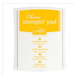
Crushed Curry Classic Stampin' Pad - 131173