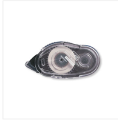
Snail Adhesive - 104332