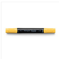
Daffodil Delight Dark Stampin' Blends Marker - 144585