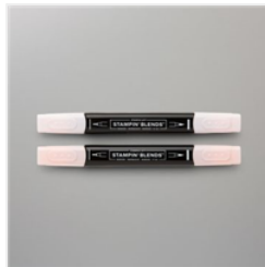
Petal Pink Stampin' Blends Markers Combo Pack - 147272