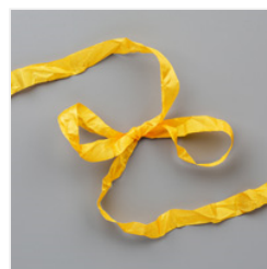
Crushed Curry 3/8" (1 Cm) Crinkled Seam Binding Ribbon - 149444