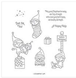
#Elfie Cling Stamp Set (En) - 150509