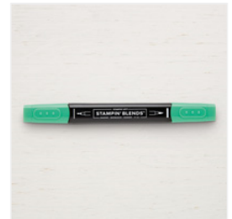
Shaded Spruce Dark Stampin' Blends - 147937