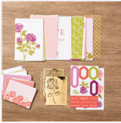
Petal Garden Card Pack - 144208