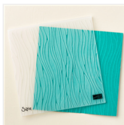
Seaside Textured Impressions Embossing Folder - 141481