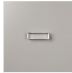
Clear Block G - 118489