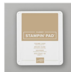
Crumb Cake Classic Stampin' Pad - 147116