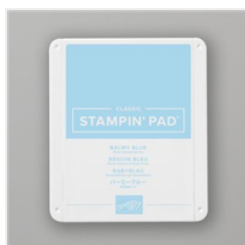
Balmy Blue Classic Stampin' Pad - 147105