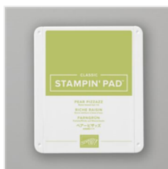
Pear Pizzazz Classic Stampin' Pad - 147104