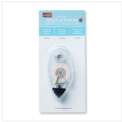
Snail Adhesive Refill - 104331