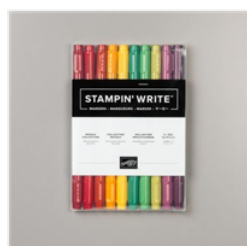
Regals Stampin' Write Markers - 147155