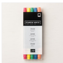
In Color 2018-2020 Stampin' Write Markers - 147159