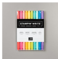
Brights Stampin' Write Markers - 147157