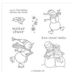
Spirited Snowmen Clear-Mount Stamp Set - 148072

Anne Granger 519-268-1540 agranger21@outlook.com www.stampwithanne.com