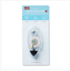
Snail Adhesive Refill - 104331

Anne Granger 519-268-1540 agranger21@outlook.com www.stampwithanne.com