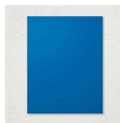
Blueberry Bushel 8-1/2" X 11" Cardstock - 146968