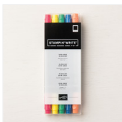
In Color 2018-2020 Stampin' Write Markers - 147159