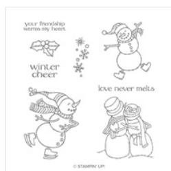
Spirited Snowmen Wood-Mount Stamp Set - 148075