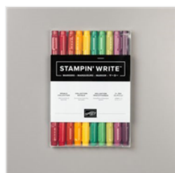
Regals Stampin' Write Markers - 147155