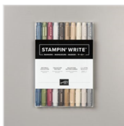
Neutrals Stampin' Write Markers - 147158