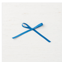
Blueberry Bushel 1/8" (3.2 Mm) Grosgrain Ribbon - 146950