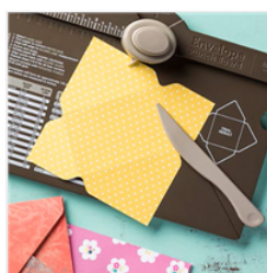
Envelope Punch Board - 133774