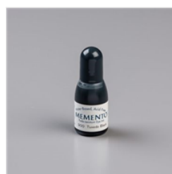
Tuxedo Black Memento Ink Refill - 133456