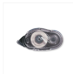
Snail Adhesive - 104332