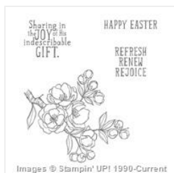
Indescribable Clear Stamp Set - 138575