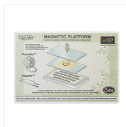
Magnetic Platform - 130658