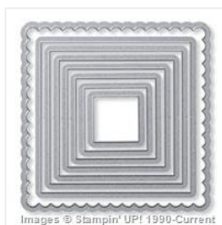
Squares Collection Framelits Dies - 130921