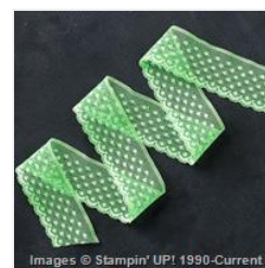
Cucumber Crush 1" Dotted Lace Trim - 138423