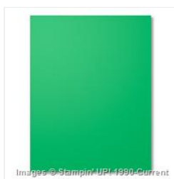
Cucumber Crush 8-1/2" X 11" Cardstock - 138335