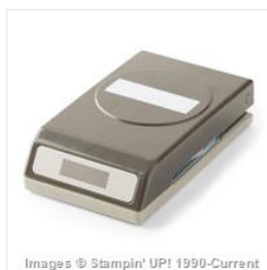
Washi Label Punch - 138296