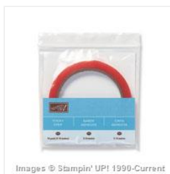
Sticky Strip - 104294