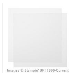
Window Sheets - 114323