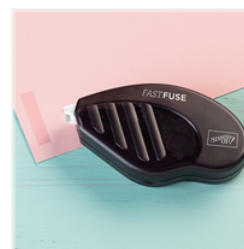
Fast Fuse Adhesive - 129026