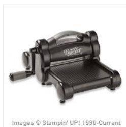
Big Shot - 113439