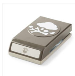
Tree Builder Punch - 138295