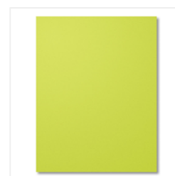
Lemon Lime Twist 8-1/2" X 11" Cardstock - 144245