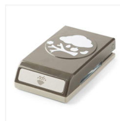
Tree Builder Punch - 138295