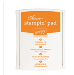
Pumpkin Pie Classic Stampin' Pad - 126945