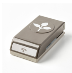
Leaf Punch - 144667