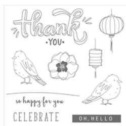
Color Me Happy Clear-Mount Stamp Set - 144069