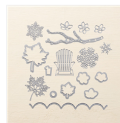
Seasonal Layers Dies - 143751