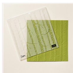
Woodland Textured Impressions? Embossing Folder - 139673