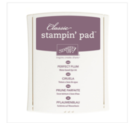
Perfect Plum Classic Stampin' Pad - 126963