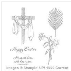
Easter Message Clear-Mount Stamp Set - 142987

http://creativemeasuresbytiffany.blogspot.com/