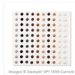
Neutrals Candy Dots - 130934