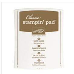
Soft Suede Classic Stampin' Pad - 126978