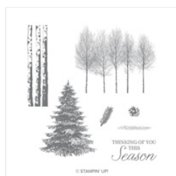
Winter Woods Clear-Mount Stamp Set - 147661