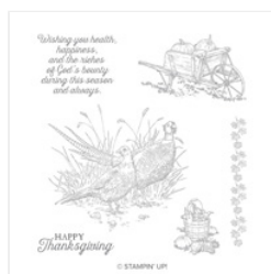
Pleasant Pheasants Clear- Mount Stamp Set - 147684