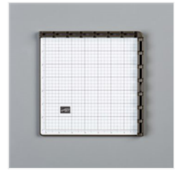
Stamparatus - 146276