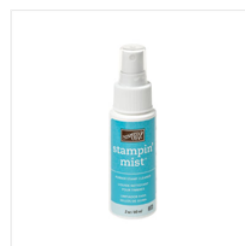
Stampin' Mist - 102394