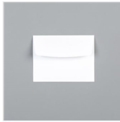
Whisper White Medium Envelopes - 107301