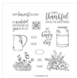
Country Home Photopolymer Stamp Set (En) - 147678