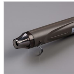
Heat Tool - 129053