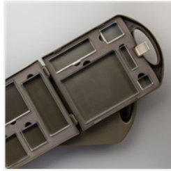
Clear Block Caddy - 120279