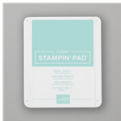
Pool Party Classic Stampin' Pad - 147107