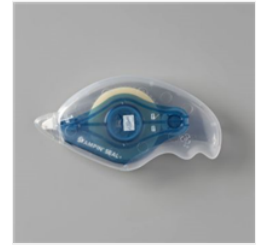
Stampin' Seal+ - 149699