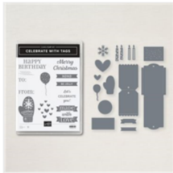
Celebrate With Tags Bundle (English) - 159867

JaNette Howard grammy25311@aol.com letsgetinky.org