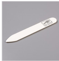
Bone Folder - 102300