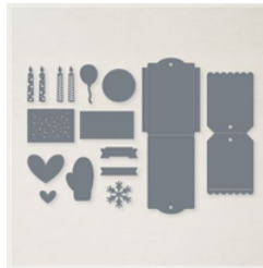
Celebrations Tag Dies - 159866