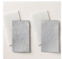
Wintry 3D Embossing Folders - 155433