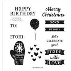
Celebrate With Tags Cling Stamp Set (English) - 159974