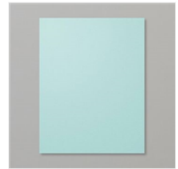
Pool Party 8-1/2" X 11" Cardstock - 122924