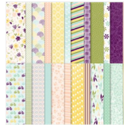
Design A Daydream 12" X 12" (30.5 X 30.5 Cm) Host Designer Series Paper - 159161