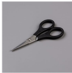
Paper Snips Scissors - 103579