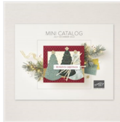
2022 July-December Mini Catalog Us (Single) - 161865