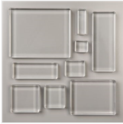
Clear Block Bundle - 118491

JaNette Howard grammy25311@aol.com letsgetinky.org