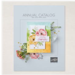
2022-2023 Annual Catalog Us (Single) - 160970