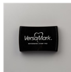
Versamark Pad - 102283