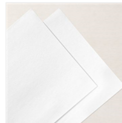
Snowy White 12" X 12" (30.5 X 30.5 Cm) Velvet Sheets - 156405