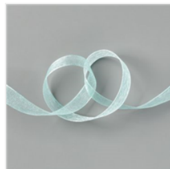
Pool Party 3/8" (1 Cm) Sheer Ribbon - 152462