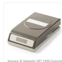
Washi Label Punch - 138296