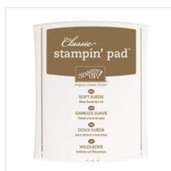
Soft Suede Classic Stampin' Pad - 126978