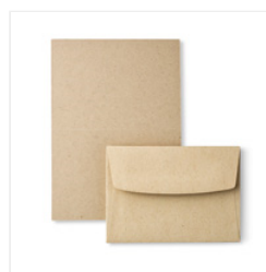
Crumb Cake Note Cards & Envelopes - 133766