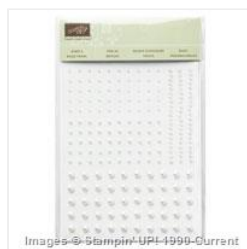
Pearl Basic Jewels - 119247