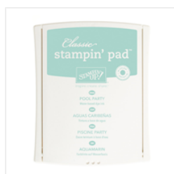
Pool Party Classic Stampin' Pad - 126982