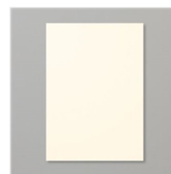
Very Vanilla A4 Cardstock - 106550