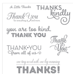
One Big Meaning Clear-Mount Stamp Set - 139420