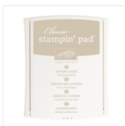
Sahara Sand Classic Stampin' Pad - 126976