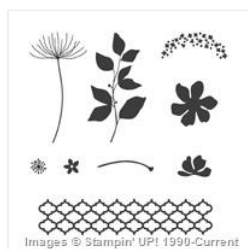
Summer Silhouettes Clear-Mount Stamp Set - 126447

https://craftydukydoodah.blogspot.co.uk/