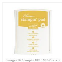
Hello Honey Classic Stampin' Pad - 133643