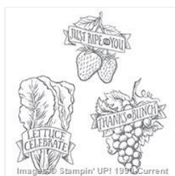
Market Fresh Clear-Mount Stamp Set - 139344