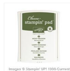
Mossy Meadow Classic Stampin' Pad - 133645