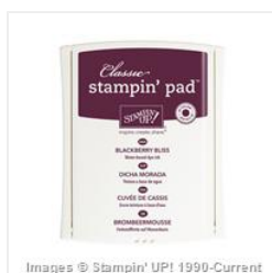
Blackberry Bliss Classic Stampin' Pad - 133642