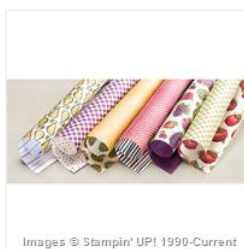
Farmers Market Designer Series Paper - 138448