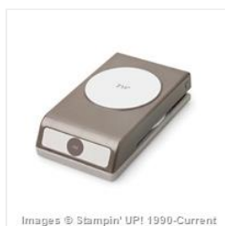
2-1/2" Circle Punch - 120906