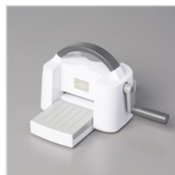
Mini Stampin' Cut & Emboss Machine - 150673