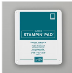
Pretty Peacock Classic Stampin' Pad - 150083