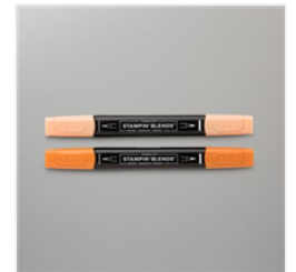
Pumpkin Pie Stampin' Blends Combo Pack - 154897