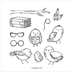
Bird'S Eye View Photopolymer Stamp Set - 161436

Judith Patterson judith@judithpatterson.net www.judithpatterson.net