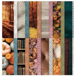
All About Autumn 6" X 6" (15.2 X 15.2 Cm) Specialty Designer Series Paper - 162178