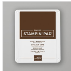
Early Espresso Classic Stampin' Pad - 147114