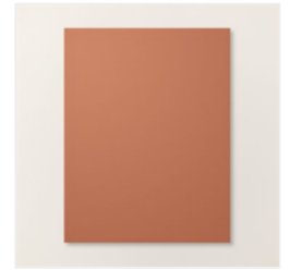
Copper Clay 8-1/2" X 11" Cardstock - 161721