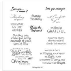
Very Best Occasions Cling Stamp Set (English) - 159871