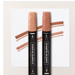
Copper Clay Stampin' Blends Combo Pack - 161662