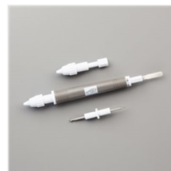
Take Your Pick - 144107