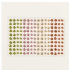
Adhesive-Backed Speckled Dots - 162191