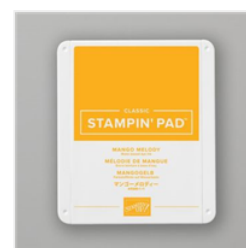
Mango Melody Classic Stampin' Pad - 147093