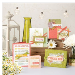
Ornate Garden Suite Collection Envelopes - 154153

https://itsastampthing-vicki.blogspot.com/