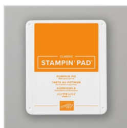
Pumpkin Pie Classic Stampin' Pad - 147086