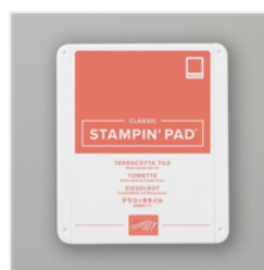
Terracotta Tile Classic Stampin' Pad - 150086