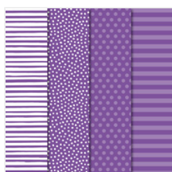
Brights 6" X 6" (15.2 X 15.2 Cm) Designer Series Paper - 146964