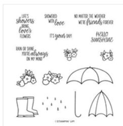
Under My Umbrella Photopolymer Stamp Set (En) - 151518