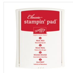
Real Red Classic Stampin' Pad - 126949