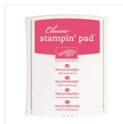
Melon Mambo Classic Stampin' Pad - 126948