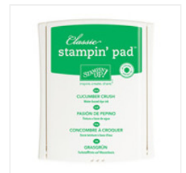
Cucumber Crush Classic Stampin' Pad - 138324