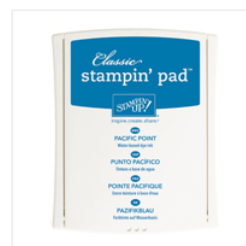
Pacific Point Classic Stampin' Pad - 126951