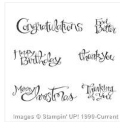
Sassy Salutations Wood-Mount Stamp Set - 132070