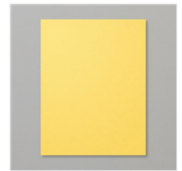
Daffodil Delight 8- 1/2" X 11" Cardstock - 119683