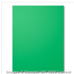
Cucumber Crush 8-1/2" X 11" Cardstock - 138335