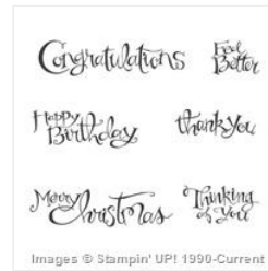
Sassy Salutations Clear-Mount Stamp Set - 126707