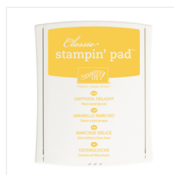
Daffodil Delight Classic Stampin' Pad - 126944