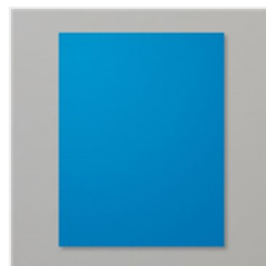
Pacific Point 8-1/2" X 11" Cardstock - 111350