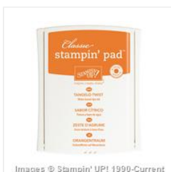
Tangelo Twist Classic Stampin' Pad - 133646