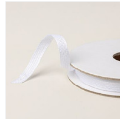
White 1/4" (6.4 Mm) Ribbon - 165562