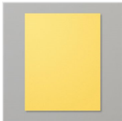
Daffodil Delight 8-1/2" X 11" Cardstock - 119683