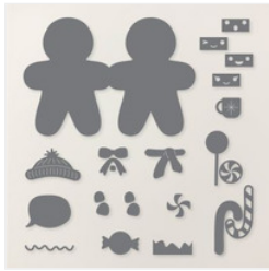
Gingerbread Man Dies - 165784

stampingwithmore@gmail.com http://www.stampingwithmore.com