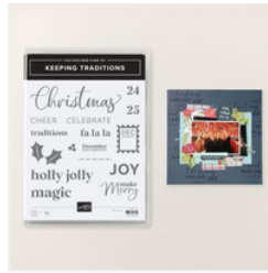
Keeping Traditions Photopolymer Stamp Set (English) - 166806