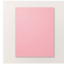
Pretty In Pink 8-1/2" X 11" Cardstock - 163793