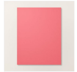
Strawberry Slush 8-1/2" X 11" Cardstock - 165625