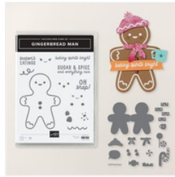
Gingerbread Man Bundle (English) - 165785