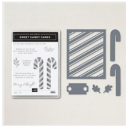
Sweet Candy Canes Bundle (English) - 161052