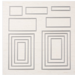
Stitched Rectangle Dies - 148551