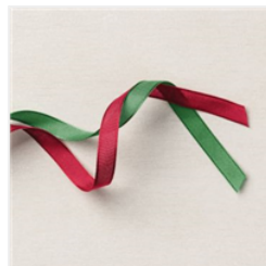
Real Red & Garden Green 3/8" (1 Cm) Ribbon Combo Pack - 159577