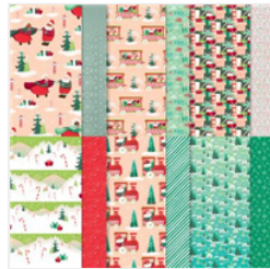
Santa Express 12" X 12" (30.5 X 30.5 Cm) Designer Series Paper - 159582