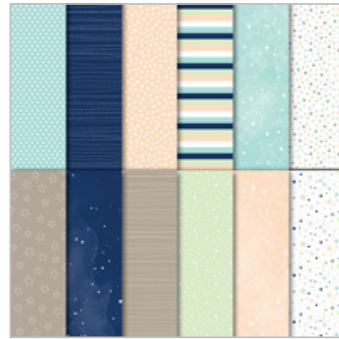
Twinkle Twinkle Designer Series