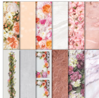
Petal Promenade Designer Series