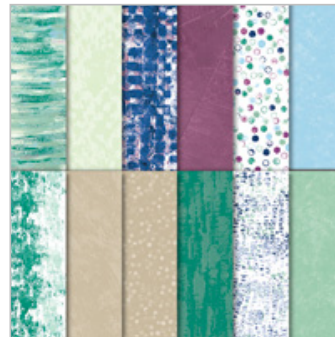
Tranquil Textures Designer Series