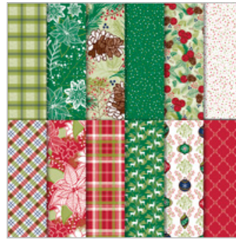
Under The Mistletoe Designer Series