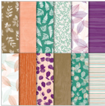
Nature's Poem Designer Series