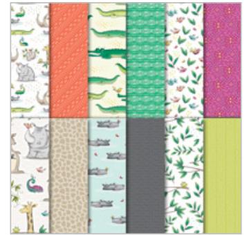
Animal Expedition Designer Series