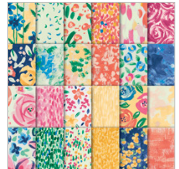
Garden Impressions 6" X 6" (15.2 X 15.2 Cm) Designer Series