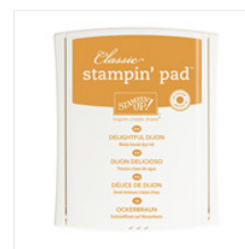
Delightful Dijon Classic Stampin' Pad - 138327