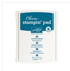
Dapper Denim Classic Stampin' Pad - 141394