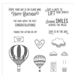
Lift Me Up Clear-Mount Stamp Set - 142896

http://creativemeasuresbytiffany.blogspot.com/