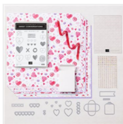
Sweet Talk Suite Collection (English) - 157629