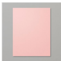
Blushing Bride 8-1/2" X 11" Cardstock - 131198