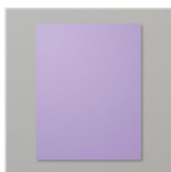
Highland Heather 8-1/2" X 11" Cardstock - 146986