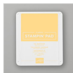
So Saffron Classic Stampin' Pad - 147109