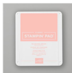
Blushing Bride Classic Stampin' Pad - 147100