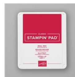
Real Red Classic Stampin' Pad - 147084