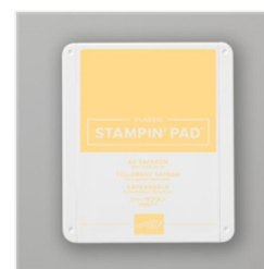
So Saffron Classic Stampin' Pad - 147109