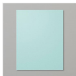
Pool Party 8-1/2\"/> X 11\" Cardstock - 122924