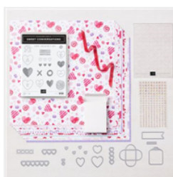
Sweet Talk Suite Collection (English) - 157629