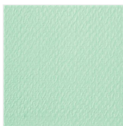
Tasteful Textile 3D Embossing Folder - 152718