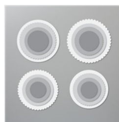
Layering Circles Dies - 151770