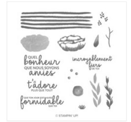
Incroyable Comme Toi Photopolymer Stamp Set (French) - 149845