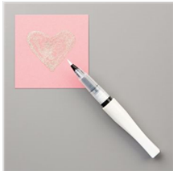
Pinceau Wink Of Stella Transparent - 141897