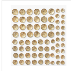
Gold Faceted Gems - 144141