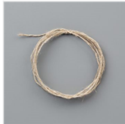
Fil De Lin - 104199