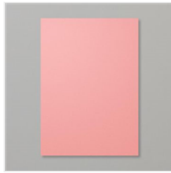
Papier Cartonné A4 Flamant Fougueux - 141421