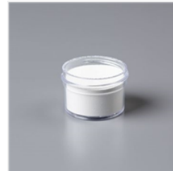
Poudre Stampin' Emboss Blanc - 109132