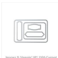
Project Life Cards & Labels Framelits Dies - 135707