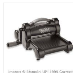
Big Shot - 113439