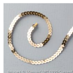
Gold Sequin Trim - 132983