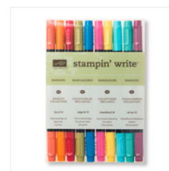
Brights Stampin' Write Markers - 131259