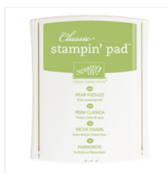
Pear Pizzazz Classic Stampin' Pad - 131180