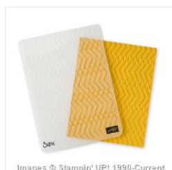
Zig Zag Textured Impressions Embossing Folder - 133738