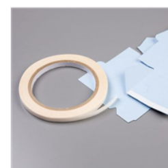
Tear & Tape Adhesive - 138995