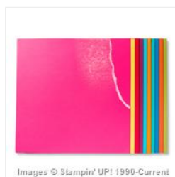
Brights Core'dinations Cardstock - 129953

http://creativemeasuresbytiffany.blogspot.com/