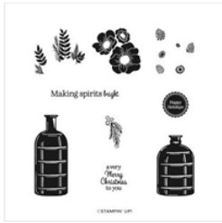
Vintage Christmas Photopolymer Stamp Set (English) - 159781