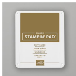
Soft Suede Classic Stampin' Pad - 147115