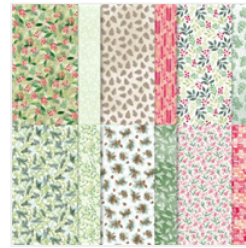
Painted Christmas 12" X 12" (30.5 X 30.5 Cm) Designer Series Paper - 156292