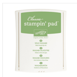
Wild Wasabi Classic Stampin' Pad - 126959