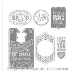
Chalk Talk Clear-Mount Stamp Set - 130634