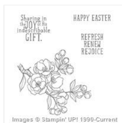
Indescribable Gift Wood Stamp Set - 137180

stampswellwithothers@gmail.com http://donnas-stampswellwithothers.blogspot.com/