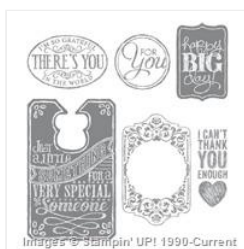
Chalk Talk Wood Stamp Set - 130631