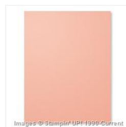
Crisp Cantaloupe 8-1/2" X 11" Card Stock - 131298