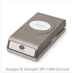
Extra-Large Oval Punch - 119859

stampswellwithothers@gmail.com http://donnas-stampswellwithothers.blogspot.com/