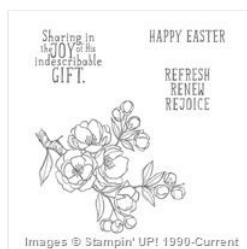
Indescribable Gift Clear Stamp Set - 138575