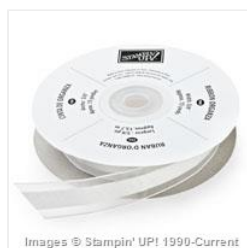
Whisper White 5/8" (1.6 Cm) Organza Ribbon - 114319