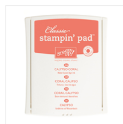
Calypso Coral Classic Stampin' Pad - 126983